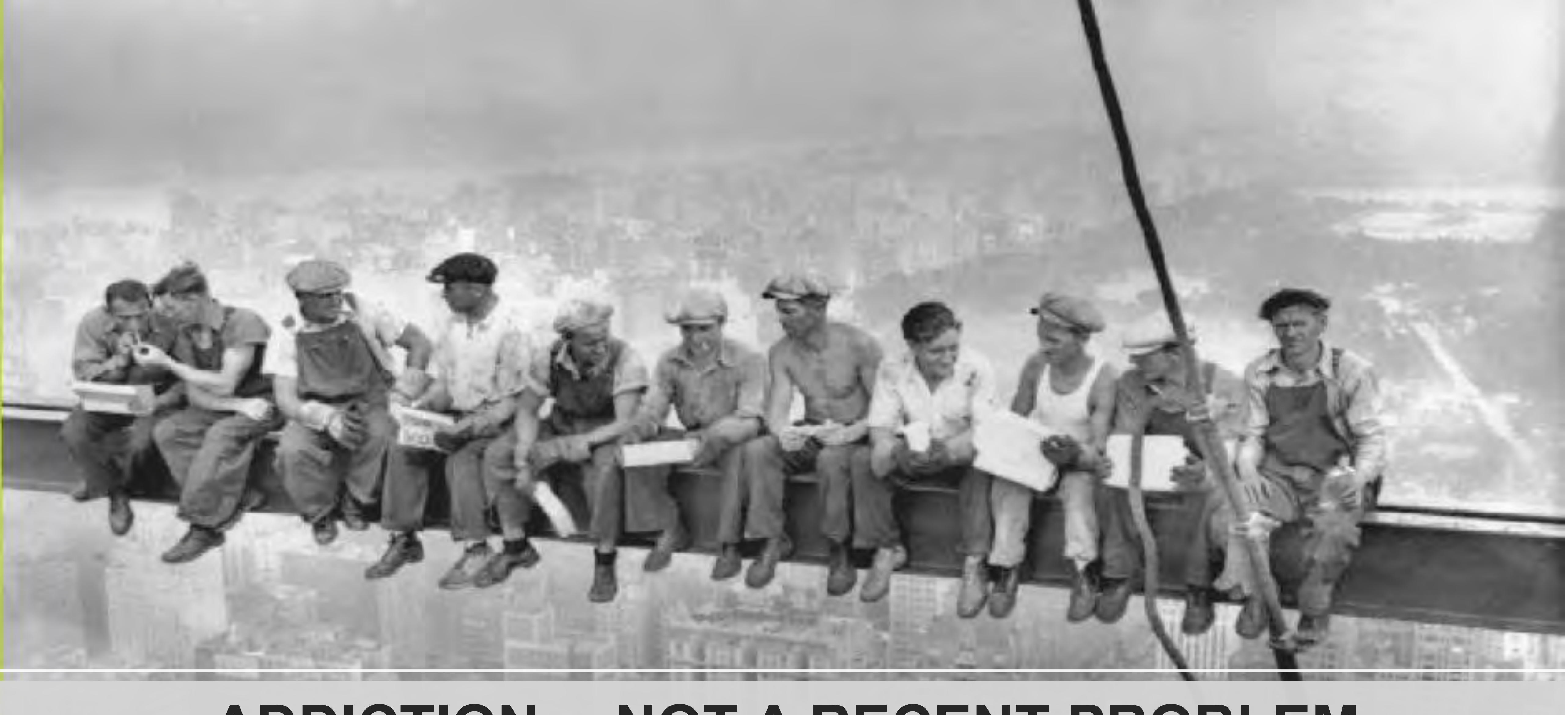
ADDICTION... NOT A RECENT PROBLEM